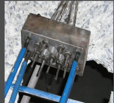
Monostrand to Button-Head P-T Splice