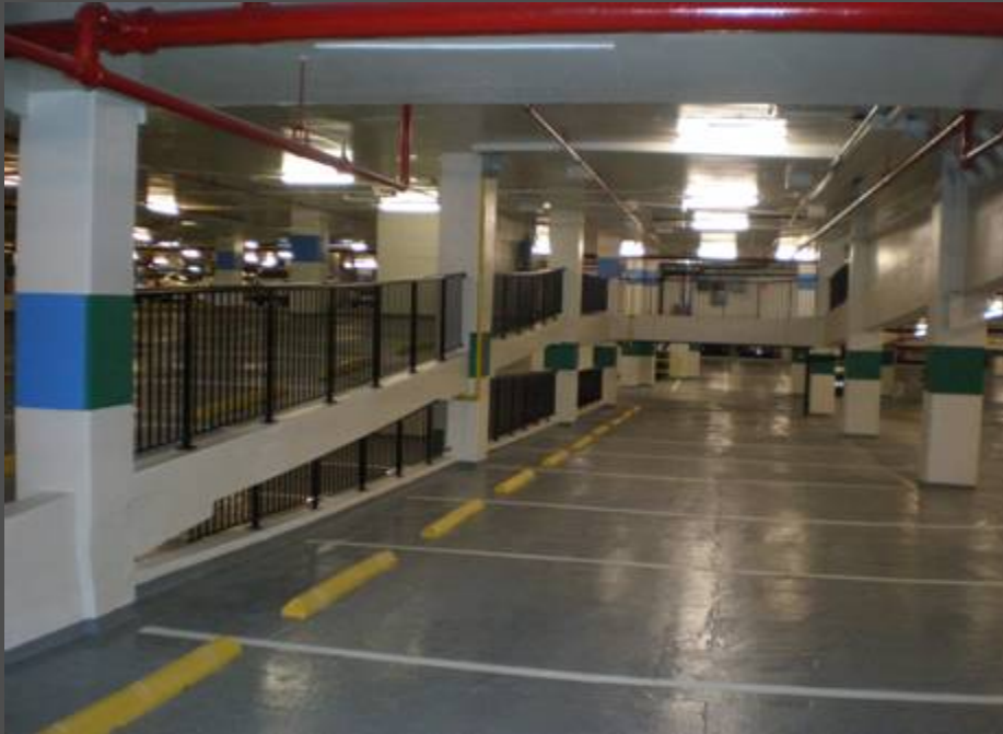
Completed Garage Repair

The concrete and post-tensioned cable repairs and waterproofing of the Buchanan House parking garage was awarded the 2009 ACI National Capitol Chapter Award of Excellence in Concrete Repair and Restoration. The work included the repair of 322 corroded button-head post tensioned cables in the concrete slab by splicing the corroded sections with monostrand cables.