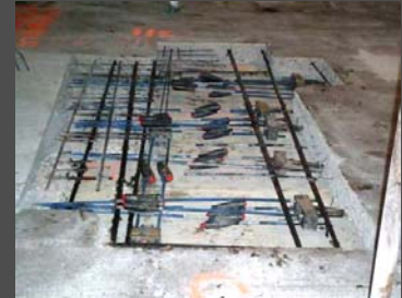
Typical Garage P-T Splices